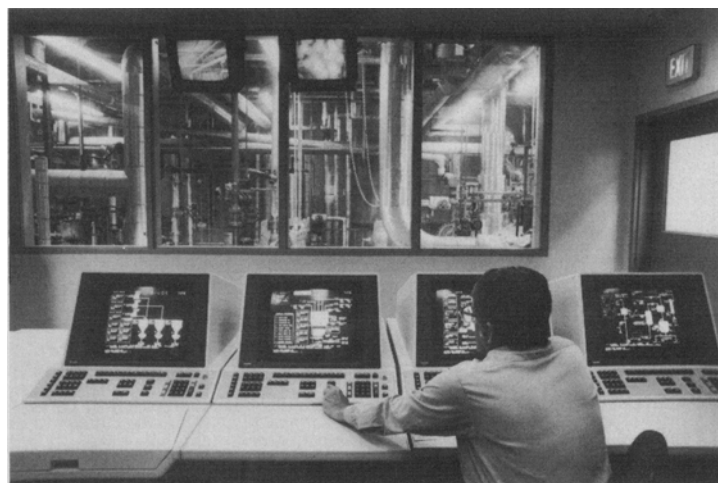
The control room features computer terminals that monitor some 100 phases of the process flow.